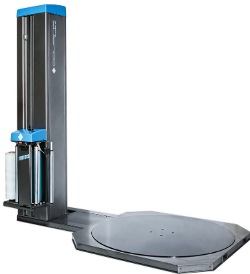
The Switch SEMI-AUTOMATIC

OR start saving money immediately and improve productivity, with the optional A-Arm already installed, ready and waiting for you.