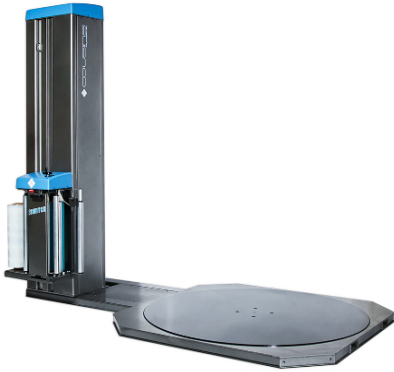
LP-SW low profile turntable (for forklift and pallet jack loading)