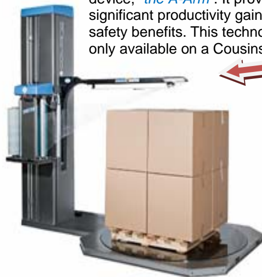
The Switch WITH A-ARM OPTION

Cousins smart engineering has developed an advanced cut and hold device, “ the A-Arm ”. It provides significant productivity gains and safety benefits. This technology is only available on a Cousins Machine.