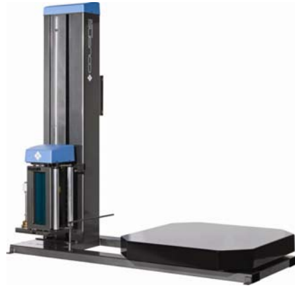
HP-SW high profile turntable (for forklift loading only)

The all new Switch will improve productivity and safety while saving you money!