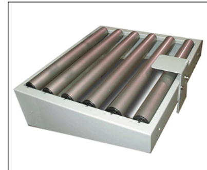
Infeed/Exit Conveyor w/ Stabilizer