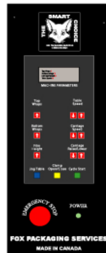
Control Panel Face