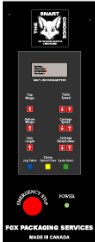
Control Panel Face