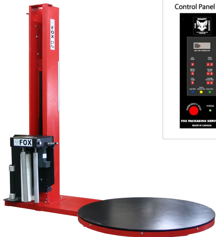
Control Panel Face