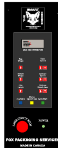
Control Panel Face