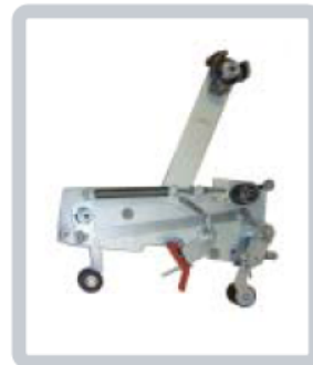
MK V tape head

Please consult factory for the many options available to customize the Centurion case tapers.